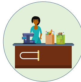
Grocery store workers