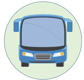
Public transit workers

You may choose from Moderna, Pfizer or J&J for your booster dose