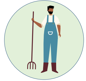
Food and agriculture workers